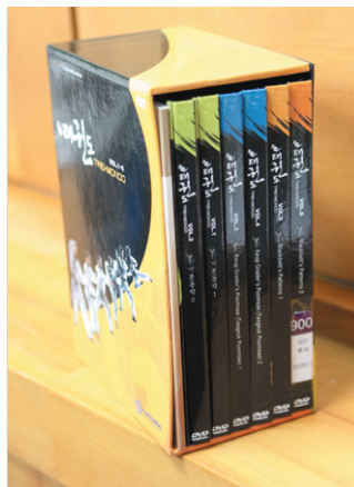
In April 2006, Kukkiwon released the 'Kukkiwon Taekwondo DVD,' an educational video featuring proper Taekwondo techniques and Poomsae.