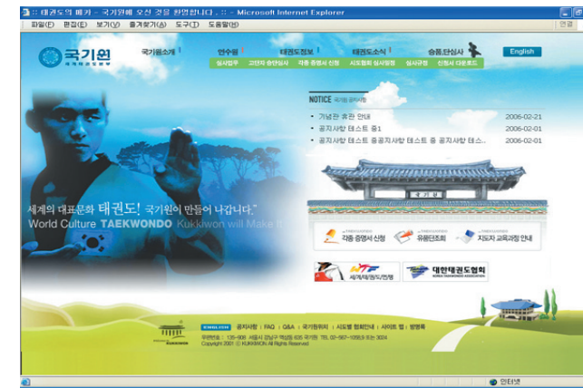
The IT automation system allowed the following administrations to be done online: △Poom · Dan promotion tests, △promotion tests by regions, △promotion tests for Upper-Dan holders, △certificate issuances, △Poom · Dan certificate reissuances, △certificate inquiries, and △leadership training institute registration.

President Uhm actively pursued the dream of a 'new Kukkiwon.' Under his leadership, the WTA was remodeled and the 2004 World Taekwondo Hanmadang witnessed the highest number of participating countries. He also unified the automation system to facilitate administrative process from provincial areas.