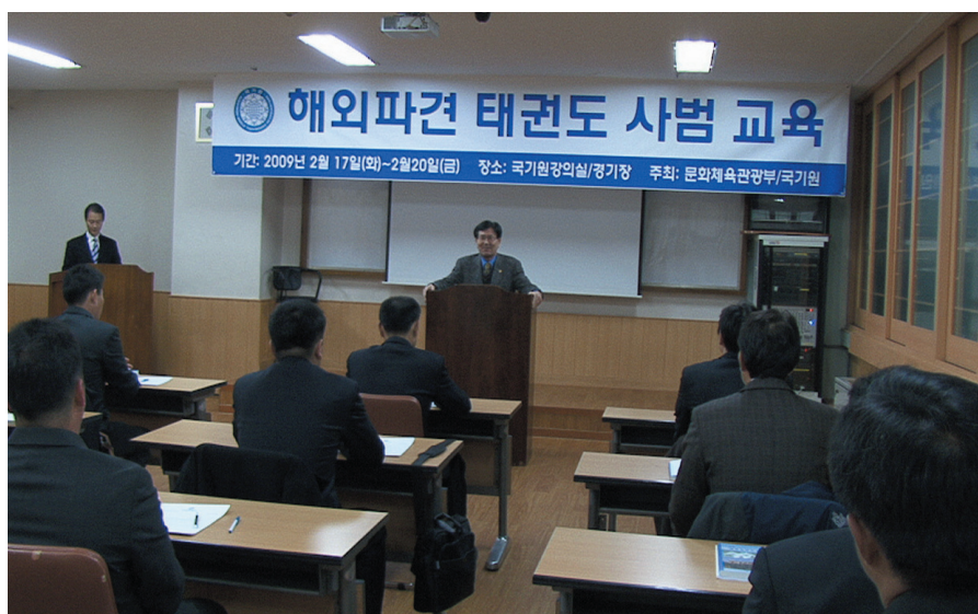
Kukkiwon conducted refresher training for sabums dispatched abroad on topics including dispatch business and purpose, Poomsae, Gyeorugi, game rules, and technique regulations.

A representative of Kukkiwon stated that “since masters are dispatched by us, not the Ministry of Foreign Affairs, we will broaden their horizons, in line with the business purpose of the Ministry of Culture, Sports and Tourism and Kukkiwon.”