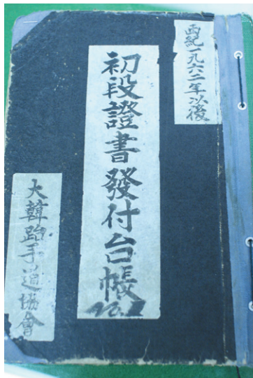
The first volume of Korea Taesudo Association's Black Belt Certificate (1962)

Gyeokpa (breaking wooden boards), and overall discipline.