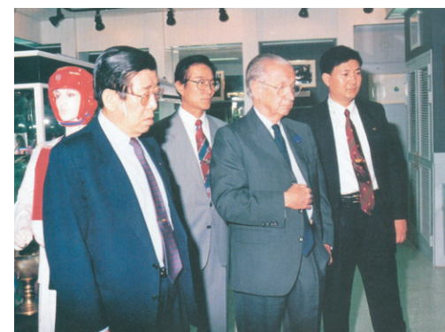
IOC President Juan Antonio Samaranch views through the exhibitions.