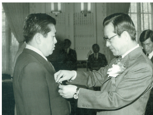
President Un Yong Kim receives the Republic of Korea Physical Education Award from Prime Minister Jong-pil Kim.

Shortly after, there was more good news. In September 1988, during the 94th IOC Session held in Hotel Shilla, Kim became the first Korean ever to be elected the IOC executive member - he also set a record for serving the longest executive term.