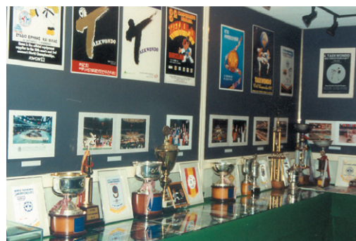
Objects on display at the Taekwondo Museum