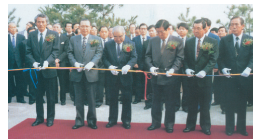
The ribbon-cutting ceremony for the Taekwondo Museum conducted on November 30, 1991.

There are 360 photographs and posters, 40 trophies, 155 medals, 147 plaques, 270 souvenirs, 400 films and