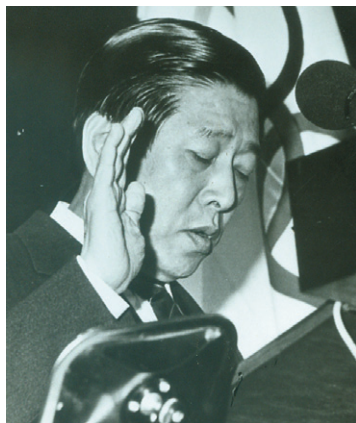
Newly-elected IOC member Un Yong Kim takes the oath of office at the IOC Session held in Lausanne, Switzerland, on October 17, 1986.