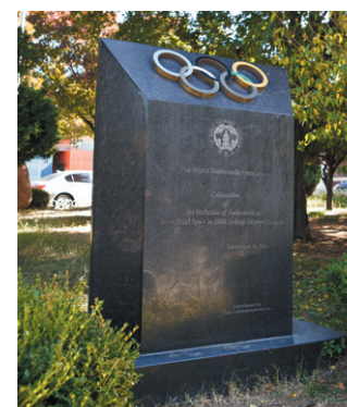
The third monument erected in 1995 was donated by Cheil Worldwide Co. to commemorate the anniversary of official sport selection for the 2000 Sydney Olympics. The Olympic logo and the WTF logo are engraved on the monument.

The second monument was erected in 1985. It celebrates worldwide recognition of Taekwondo as it was selected as an official sport for the 1986 Asian Games in Seoul and also as a demonstration sport for the 1988 Seoul Olympics. The third monument was erected 10 years later in 1995 to commemorate the selection as an official sport for the 2000 Sydney Olympics. The Olympic rings and the World Taekwondo