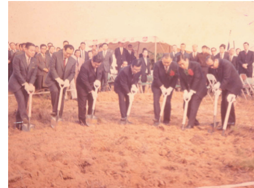
Groundbreaking Ceremony for Kukkiwon held on November 19, 1971

Kukkiwon held a groundbreaking ceremony for Central Dojang on the hills of Yeoksam-dong Gangnam-Gu, Seoul on November 19, 1971. Attendees at the