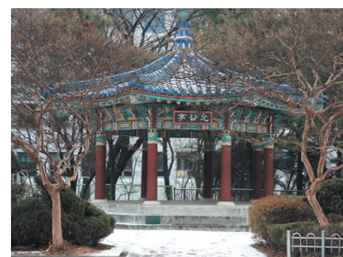
The Yoon Gok Jung - a pavilion named after Un Yong Kim's pseudonym