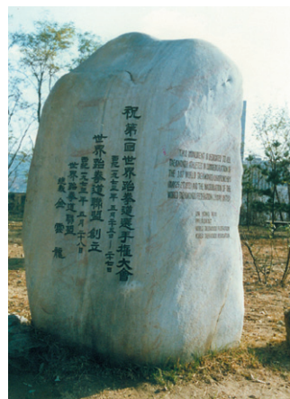
"In Celebration of the First World Taekwondo Championship. May 25-27, 1973 AD. World Taekwondo Federation Establishment. May 28, 1973. World Taekwondo Federation President Un Yong Kim"